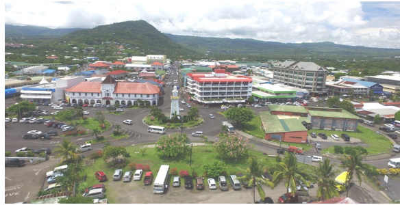
Apia is growing quickly. Over time, and with increasing development, there is a need to ensure proper strategic planning.

communities; sustainable use of natural resources; economic growth; and equitable access to transport,